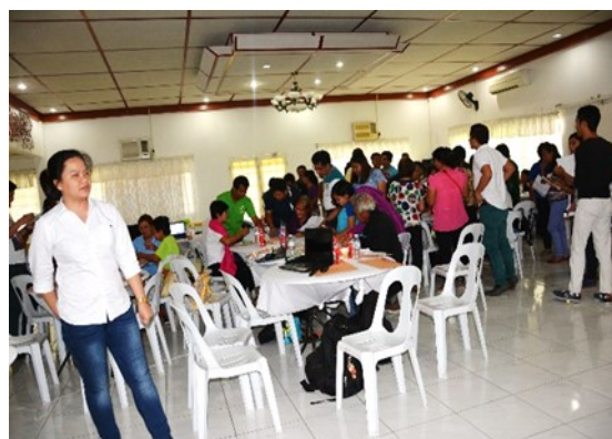
The participants play the get-to-know each other game