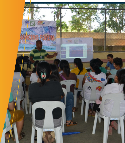
Financial Forum at Baco Gymnasium, Baco held last January 18, 2016.