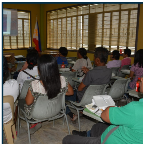
Financial Forum at Bahay Tuklasan, Naujan held last January 19, 2016.