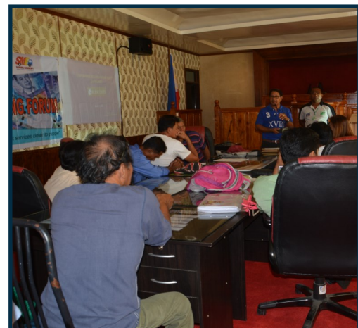
Financial Forum at ABC Hall Pinamalayan held last January 19, 2016.