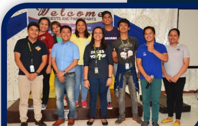
DTI facilitators with student facilitators from DWCC