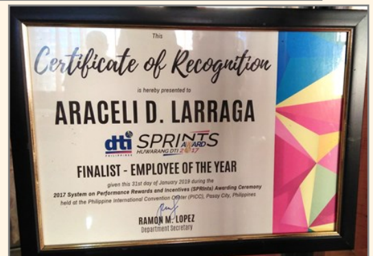
A DTI Pin, Plaque and Certificates of Recognition were given to awardees during the 2017 SPRInts Huwarang DTI Awards.