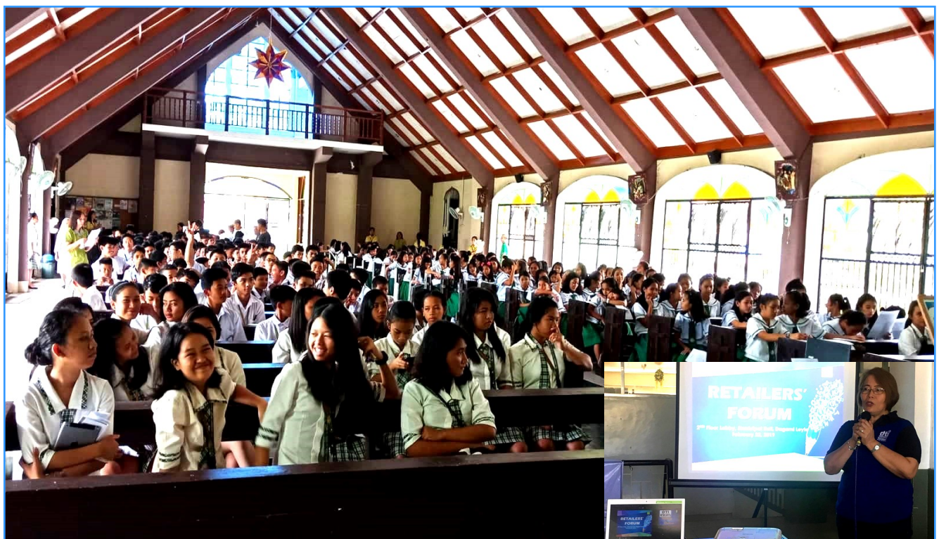
A total of 145 students of St. Joseph High School of Dagami, Inc. were oriented of their consumer rights and responsibilities during the Consumers' and Retailers' Forum held last February 22, 2019 at Dagami, Leyte