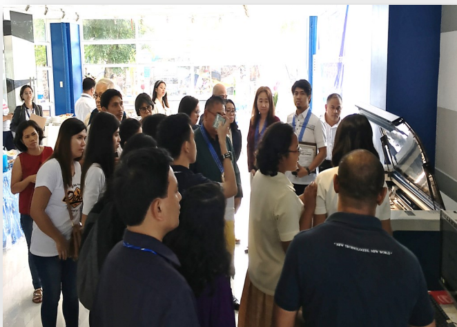
Demonstration of the CO2 Laser Cutter and Engraver