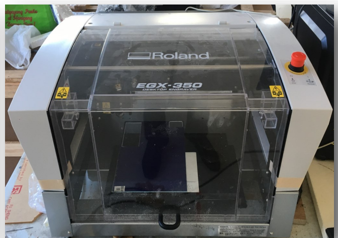
Bench Top Milling Machine & Digital CNC Milling Machine