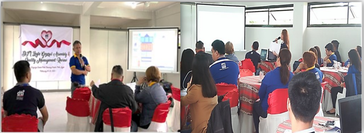
Presentation and critiquing of Action Plans of the five process flows for ISO 9001:2015 Certification

DTI Leyte Provincial Office conducted its second Provincial Quality Management Review last February 14 to 15, 2019 at the Training Center of Negosyo Center Palo in Palo, Leyte in preparation for the Internal Audit scheduled this April 2019.