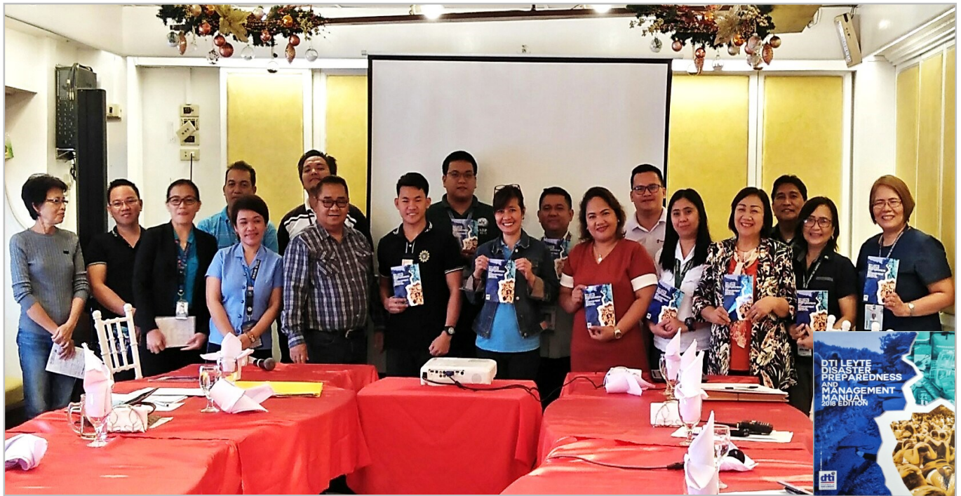
Copies of the DTI Leyte Disaster Preparedness and Management Manual 2018 Edition were distributed to Leyte ConsumerNet member agencies during the Leyte ConsumerNet Meeting held last February 21, 2019 at Ocho Seafoods and Grill, Tacloban City