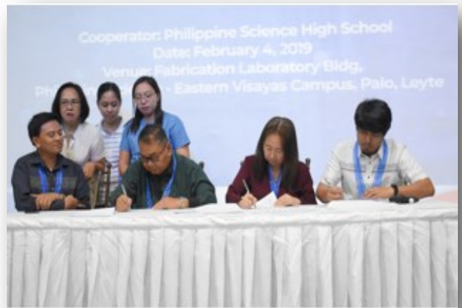
Signing of the Usufruct Agreement