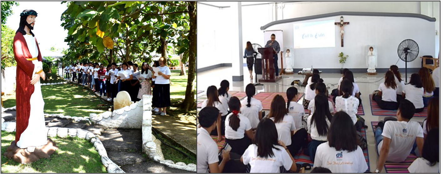
First Quarter Provincial Governance Scorecard Review and OCI at our Lady of Queen of Peace Hermitage, Kananga, Leyte, March 29, 2019