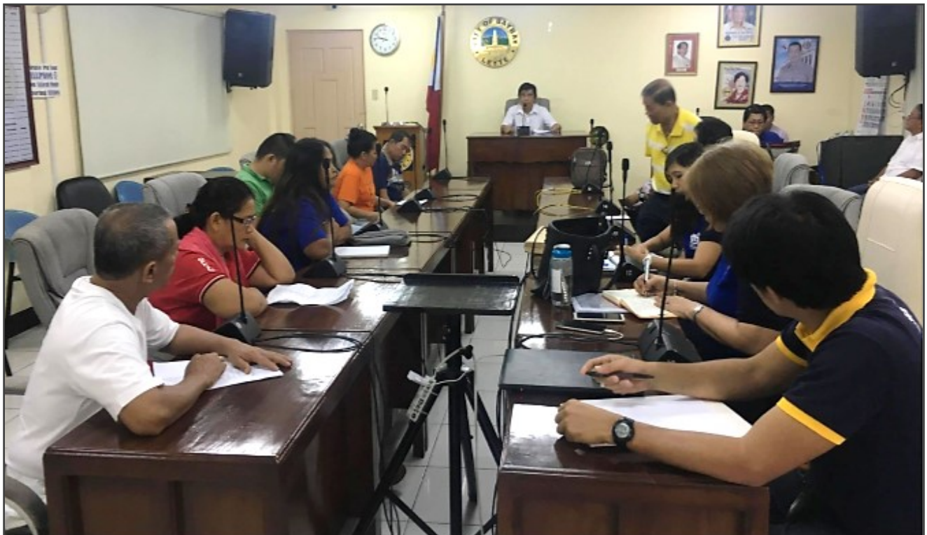
Local Price Coordinating Council Meeting in Baybay City, Leyte last March 27, 2019