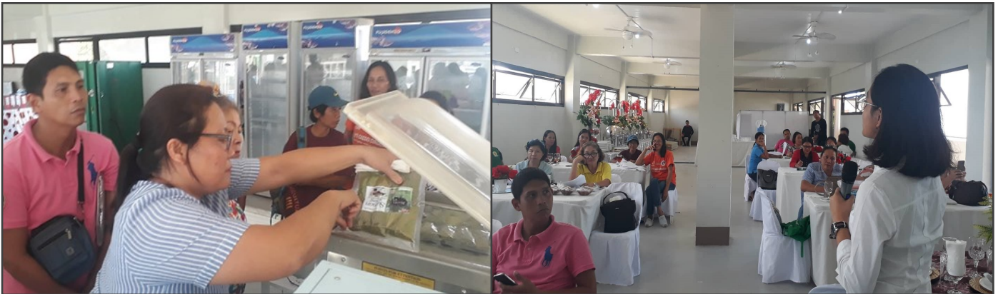
Training for the Food Processors of the Toll Packaging Center in Palo, Leyte last March 20, 2019