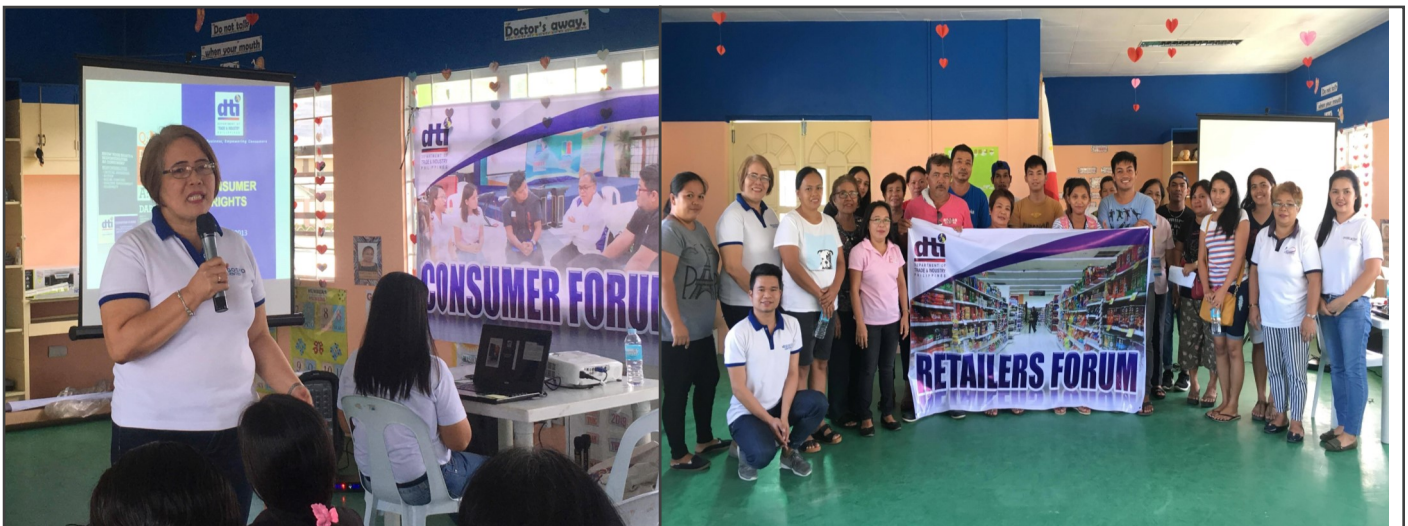
Consumers and Retailers Forum conducted in San Miguel, Leyte last March 20, 2019. The activity was attended by 100 consumers, owners and representatives of the local businesses operating in the municipality.