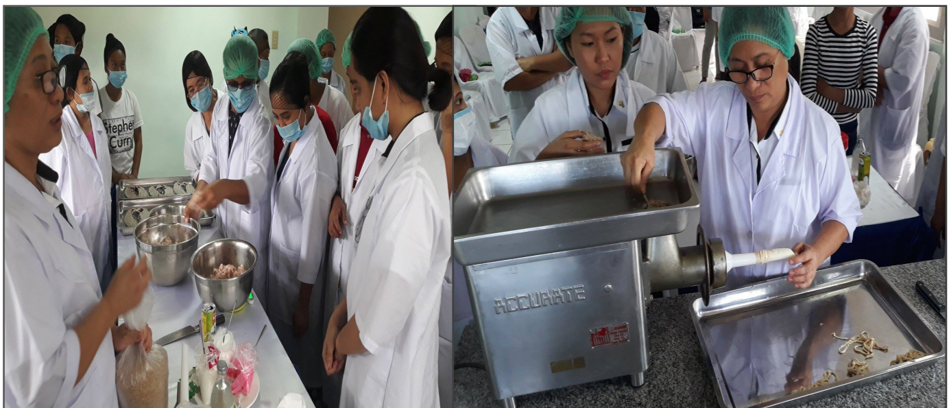
Enhanced Development Training for Saint Joseph Multi-Purpose Cooperative (SJMPC) members and potential SSF beneficiaries conducted last March 25, 2019 at Babatngon Leyte.