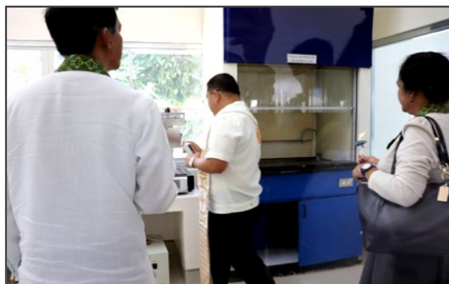
Blessing of the 20M worth of Food Lab SSF equipment which include a Fully Automatic Digestion Unit shown in above photo.