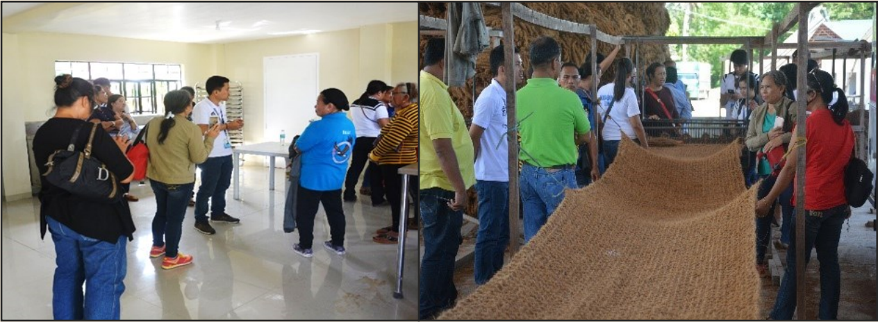
In-plant visit of Leyte NCBCs/SSF Ambassadors and MSMEs to the different shared service facilities in the province last October 22-23, 2018

DTI-Leyte Provincial Office capacitates local entrepreneurs and Leyte Negosyo Center Business Counsellors (Leyte NCBCs) and MSMEs about the features, functions, and use of each Share Service Facility (SSF) centers thru In-Plant visits for them to be aware and appropriately disseminate relevant information to other potential MSME users in the nearby areas where SSF facilities are located.