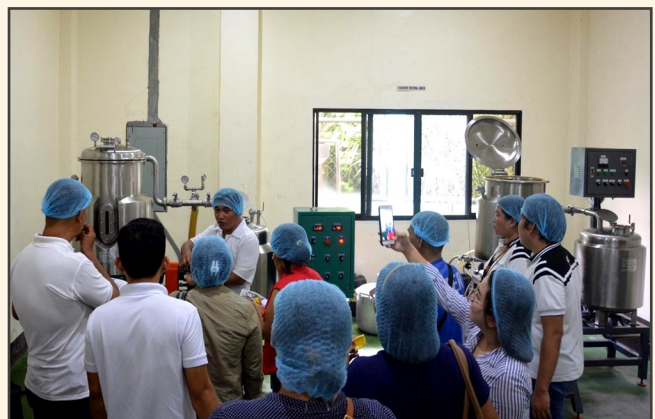
Leyte NCBCs/SSF Ambassadors and MSMEs were briefed about the Jackfruit Food Processing SSF in Baybay, City

A total of 76 potential clients were identified as would-be beneficiaries of the shared service facilities in the province of Leyte. Brochures and flyers were also crafted by the Leyte Negosyo Center Business Counsellors to intensify its promotion and strengthen the operationalization of existing shared service facilities. Interested clients are also encouraged to visit the nearest Negosyo Center in their area.###