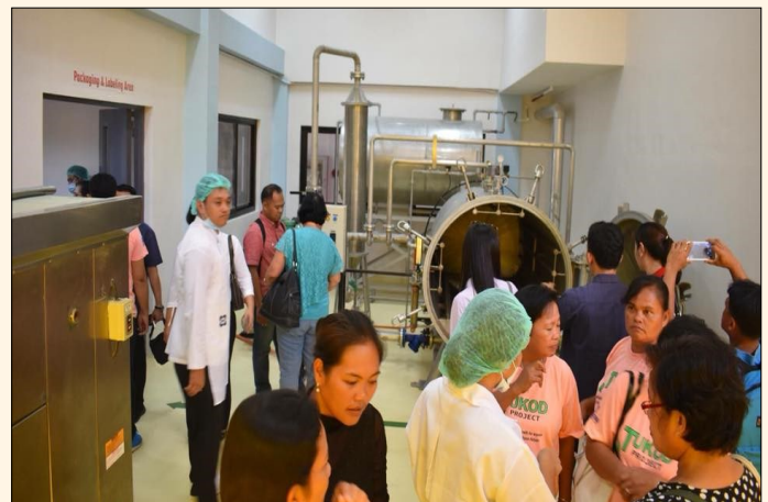
An inside look into the EVSU Retort Shared Service Facility in EVSU Main Campus, Tacloban City