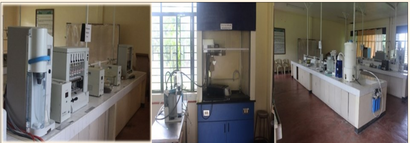
VSU Food Testing Laboratory Shared Service Facility

The first phase of the project started in 2016 with four sets of equipment amounting to P2,539,779.00. To complete the Food Analyses requirement for LTO Certification, additional equipment amounting to Php20Milion pesos was approved by NTWG for the 2018 SSF Project fund. The Project is expected to be fully operational by 2019. ###