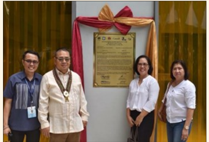
Unveiling of the of the EVSU Water Retort Facility Signage

For 2018, DTI Leyte proposed for the establishment and/or improvement of three (3) major Shared Service Facilities in the Province namely; Food Testing Laboratory in Visayas State University, Baybay City, Fabrication Laboratory located at Philippine Science High School in Palo, Leyte and the Water Retort Facility in Eastern Visayas State University in Tacloban City. The total project cost of these three SSFs amounted to Php78.2 Million pesos where DTI Leyte SSF counterpart is 56% or a total of Php43.8M. These projects were eventually approved by the SSF-National Technical Working Group (NTWG) after careful deliberation and are now under procurement with some of the equipment are already for delivery.