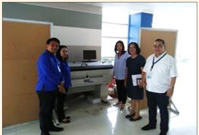
PSHS-EVC Fabrication Laboratory SSF

The Digital Fabrication Laboratory in PSHS-EVC with total project cost of Php13Million pesos approved by NTWG for 2018 SSF Project Fund, is for educational outreach that is an extension of its research into digital fabrication and computation. It is a technical prototyping platform for ideation, innovation, and invention.