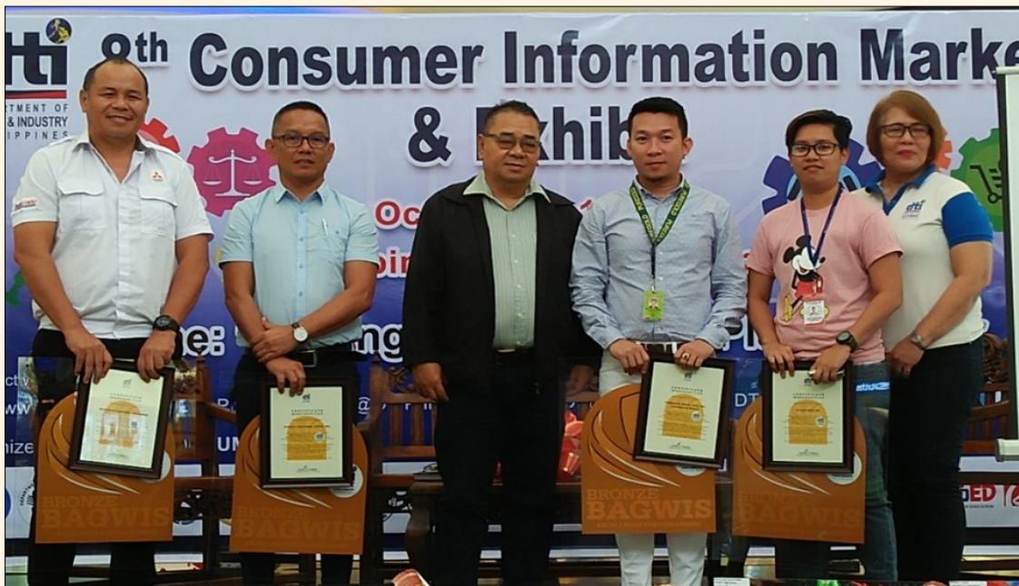
DTI Bagwis Bronze Seal of Excellence Awardees in Tacloban City namely: Toyota Tacloban, Mitsubishi Motors, Puregold Marasbaras & IPCAR Technology