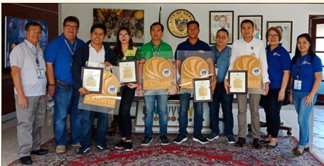
DTI Bagwis Bronze Seal of Excellence Awardees in Ormoc City namely: Home Options Inc.-Ormoc, Citi Hardware Bacolod, Inc.- Ormoc, Emerald Mini Depot Corp.-Ormoc, EBR Marketing Corp., & Gaisano Capital Riverside Mall with DTI Leyte Officials and staff