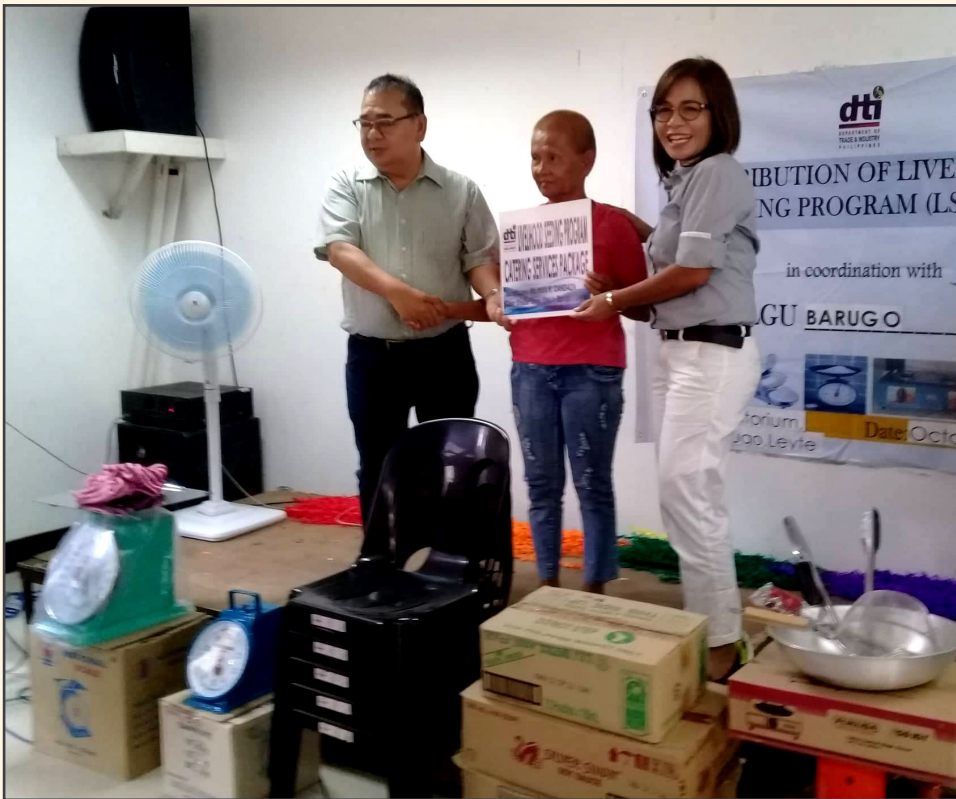
Barugo Municipal Mayor Ma. Rosario Avestruz and the Provincial Director of DTI Leyte led the distribution of livelihood starter kits in Barugo, Leyte last October 22, 2018

DTI Leyte Provincial Office distributes livelihood starter kits/grants in kind to a total of 2,379 Small Medium Enterprises affected by Super Typhoon Yolanda through DTI's Livelihood Seeding Program (LSP).