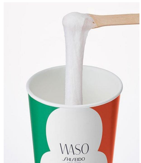
Shiseido Waso Silky Smooth Mochi Mask

Shiseido Waso Silky Smooth Mochi Mask allows the user to mix the liquid and powder substances in the provided cup to create their preferred texture, consistency and size. The warming sensation and the texture similar to freshly pounded mochi are said to relax skin and mind