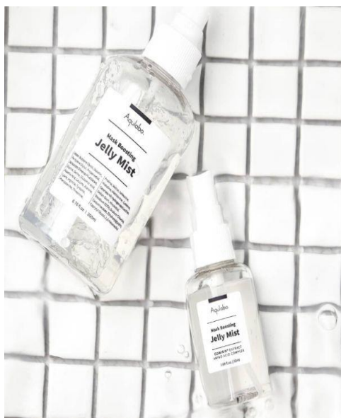
Aqualabo. Mask Boosting Jelly Mist (South Korea)

Jelly mists can be used to introduce an additional skincare step that boosts the use of facial masks for intensified moisture.