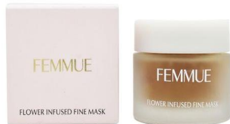
Peach & Lily Femmue Flower Infused Fine Mask