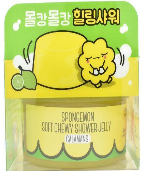
Monvely Monster Spongemon Soft Chewy Shower Jelly Calamansi (South Korea)

Avon's Soapy Slime Body Cleanser comes in a wiggly green, jelly-like slimy texture said to inspire kids' imagination and offer 100% fun. Similarly, Crayola has created Play Dough-inspired Bath Slime soaps in various scents.