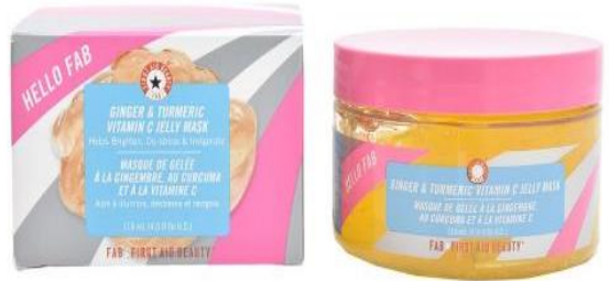
FAB First Aid Beauty Hello FAB Ginger & Turmeric Vitamin C Jelly Mask

Peach & Lily Femmue Flower Infused Fine Mask features a juicy wash-off texture that helps achieve the elusive 'glass-skin' effect, while FAB Ginger & Turmeric Vitamin C Jelly Mask is described as an addictive texture that awakens the senses.