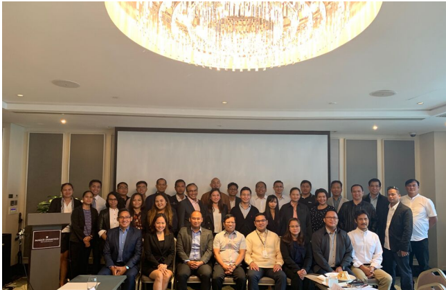
Attendees of the sub-committee on enforcement