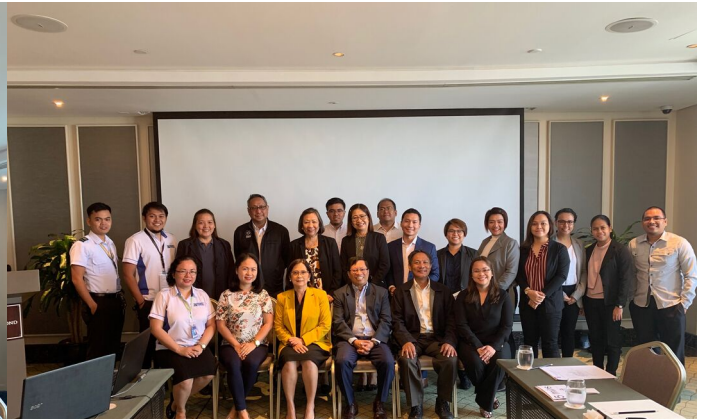
Attendees of the sub-committee on technical reachback